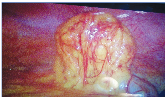
[Table/Fig-2]: Inflamed epiploic appendage arising from ascending colon of patient no. 6.

After obtaining anaesthetic assessment for surgery, all patients were subjected to a diagnostic laparoscopy, in view of confusing clinical presentation and radiological findings. On diagnostic laparoscopy, in all the patients epiploic appendagitis was noted, with origins from caecum (three patients), ascending colon (three patients) and sigmoid colon (two patients). Primary torsion of epiploic appendage was seen in 4/8 patients without any other pathology and underwent laparoscopic excision of epiploic appendagitis. Remaining four patients had evidence of acute appendicitis associated with torsion of adjacent epiploic appendage and underwent laparoscopic excision of epiploic appendagitis with appendectomy [Table/Fig-2,3].