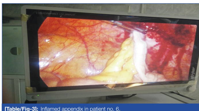
[Table/Fig-3]: Inflamed appendix in patient no. 6.